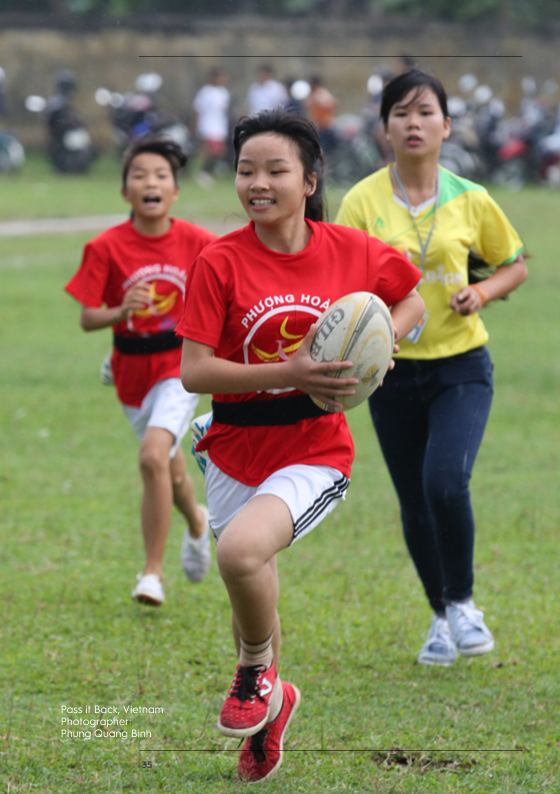
Pass it Back, Vietnam