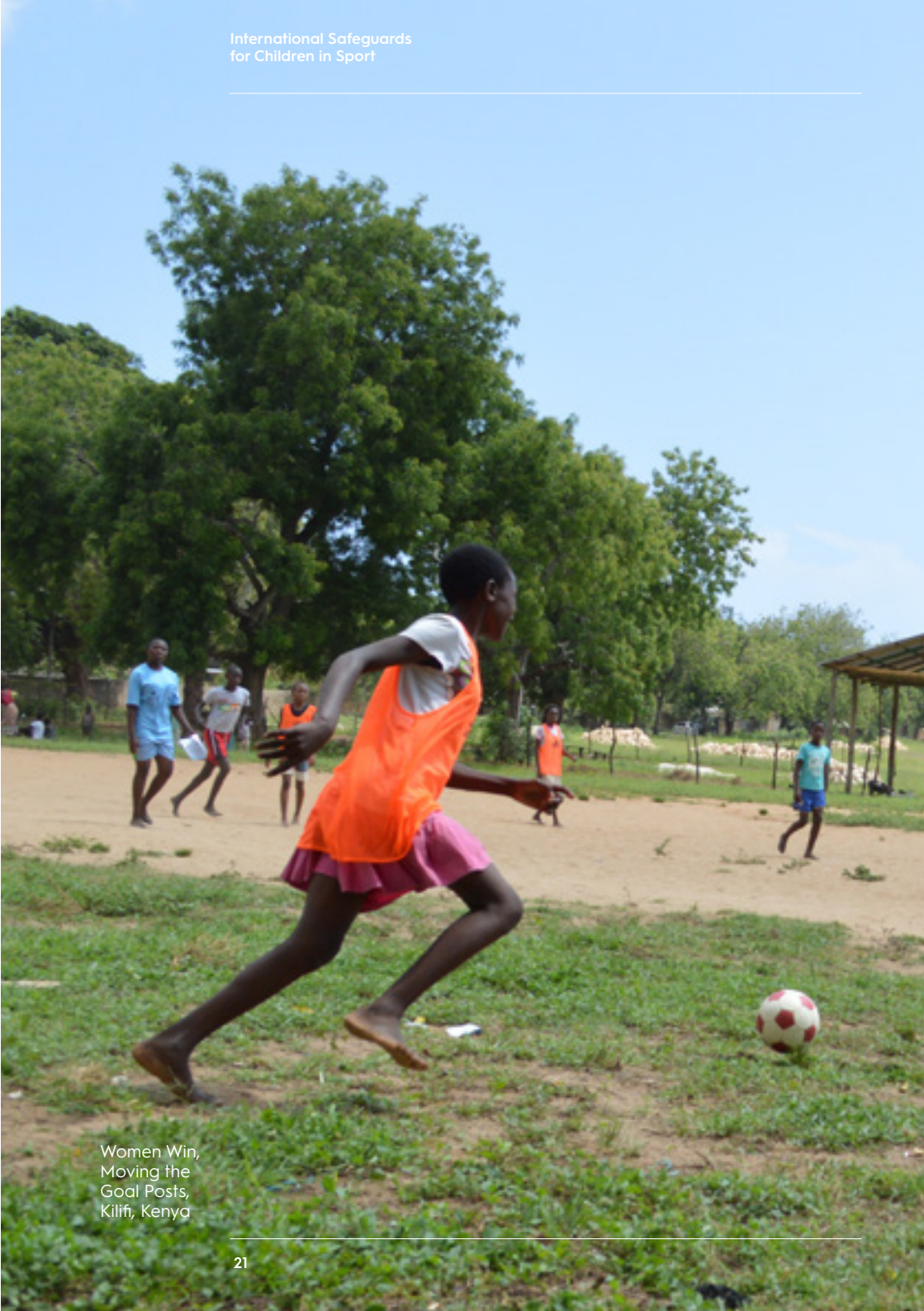
Women Win, Moving the Goal Posts, Kilifi, Kenya