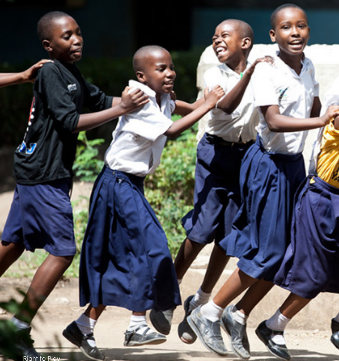
Right to Play 2013 Tanzania