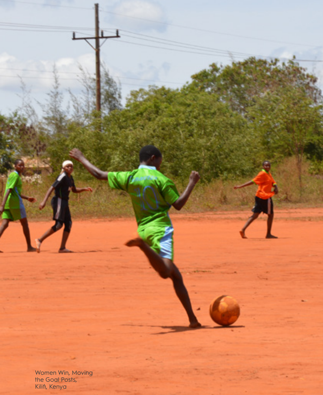
Women Win, Moving the Goal Posts, Kilifi, Kenya