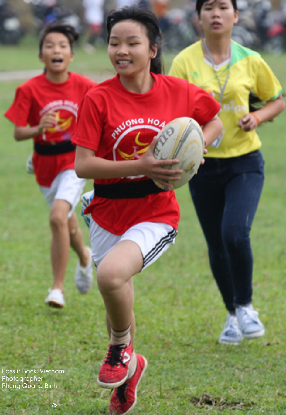
Pass it Back, Vietnam